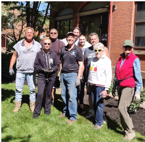
Weeding and mulching and planting, oh my!

A big "Thank You!" to the volunteers who turned out for this year's Garden Flash Mob on Saturday, May 23. The crew literally "dug in" with weeding the beds and planting a variety of blooming annuals, which followed with spreading 140 bags of mulch in both the Joseph and Mary Gardens. The beds are now set for a summer's worth of growth and beauty. Many hands, light work - our volunteers are a constant reminder of that wise adage!